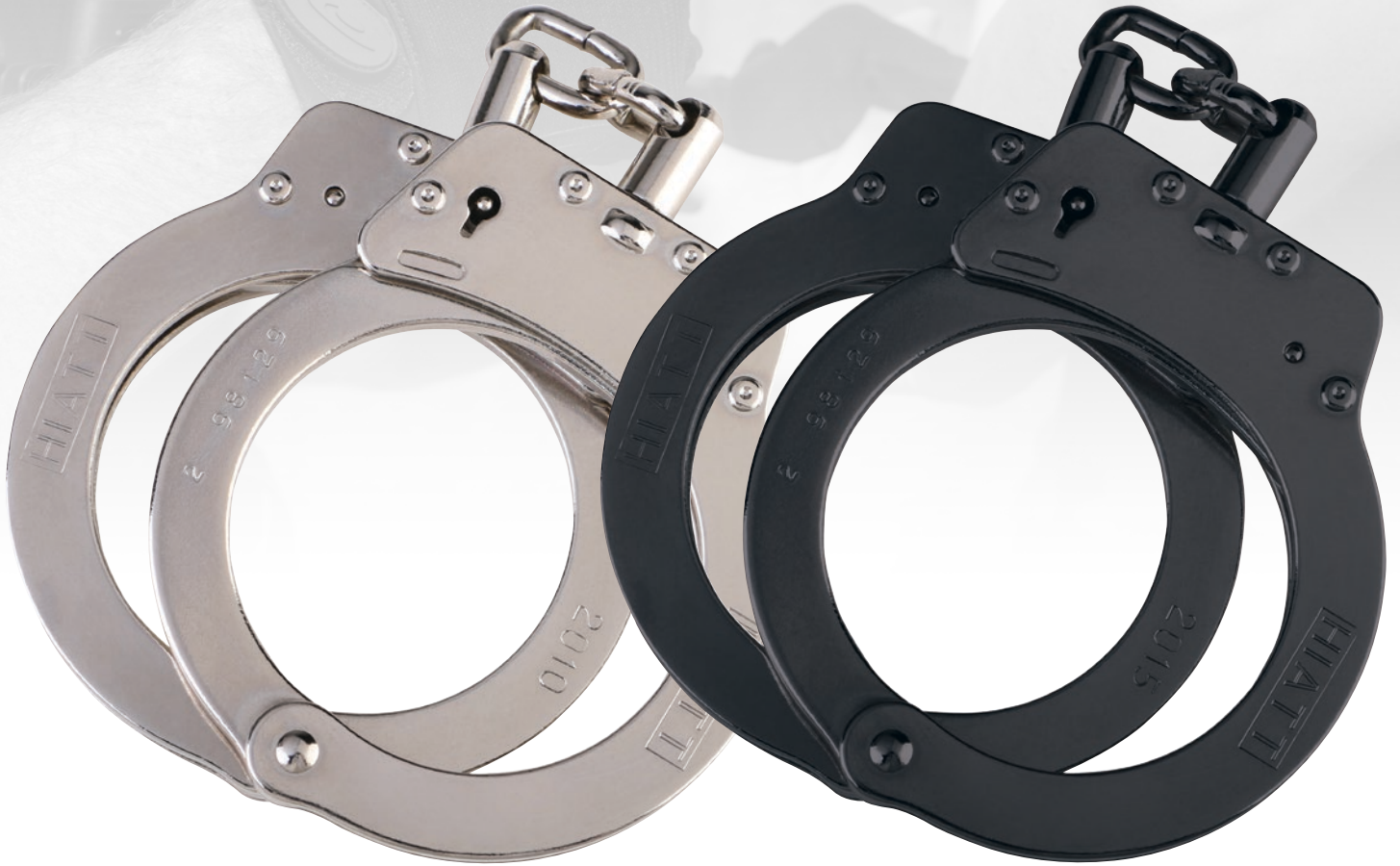
Model 2010H: Nickel Plate finish