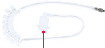
User Installable gel tip or foam