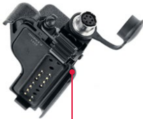
Radio adapter with PTT